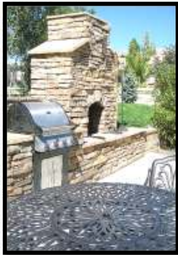
Exterior woodburning fireplace