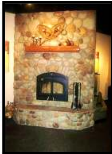
Castle Rock Showroom