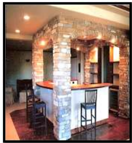
Basement bar embellishment