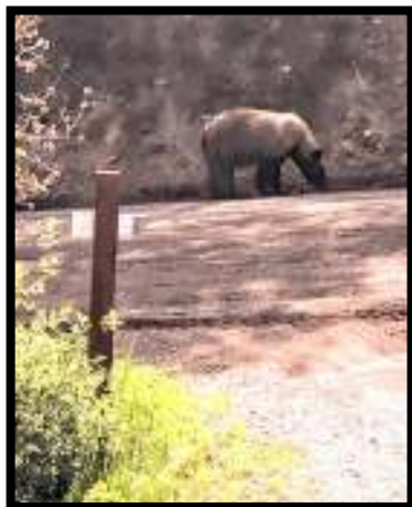
Submitted by Sue Dowd

The bears have been pretty active lately, and it's been easy to spot them doing their thing. Remember to keep the bears out of trouble by securing all trash and other attractants. Keep your cars locked, too, as that rogue French fry under the seat may catch their attention. Most of us never get tired of seeing these magnificent creatures. Protect them and always be bear aware, they don't like to be surprised. If you have wildlife pictures you want to share, submit them to valleyhawk7@msn.com . Thank you, Sue Dowd, for spotting this bear on the road.