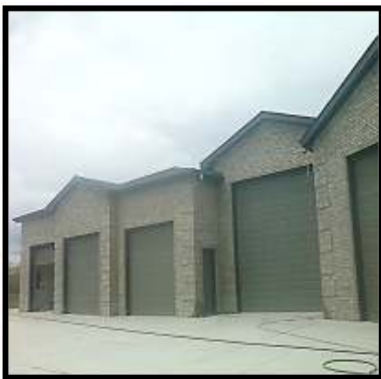
Garage built for 55 collector cars