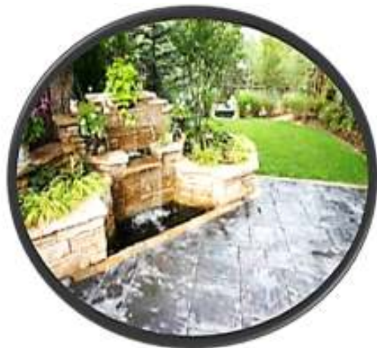
Water feature and stone tile in Denver